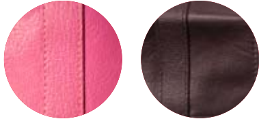
Hot stamping on grainy and vintage leather

Goatskin Leather Vegetable tanning 100% natural & 100% recyclable